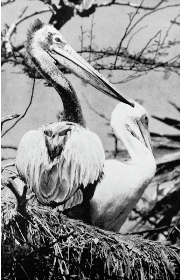
Adult Spot-billed Pelican and its chick, photographed by E.P. Gee – THE WILDLIFE OF INDIA